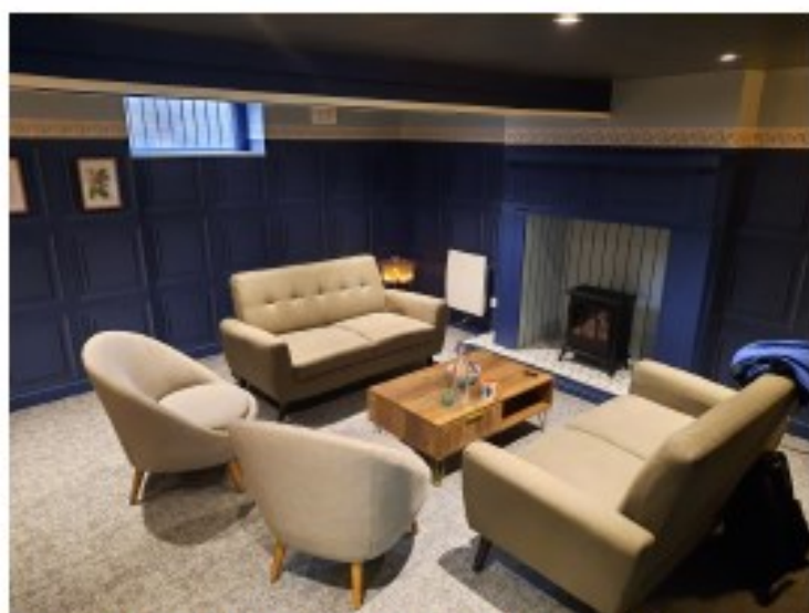
Our cosy environment at Brighub, Brighouse (Calderdale Centre)