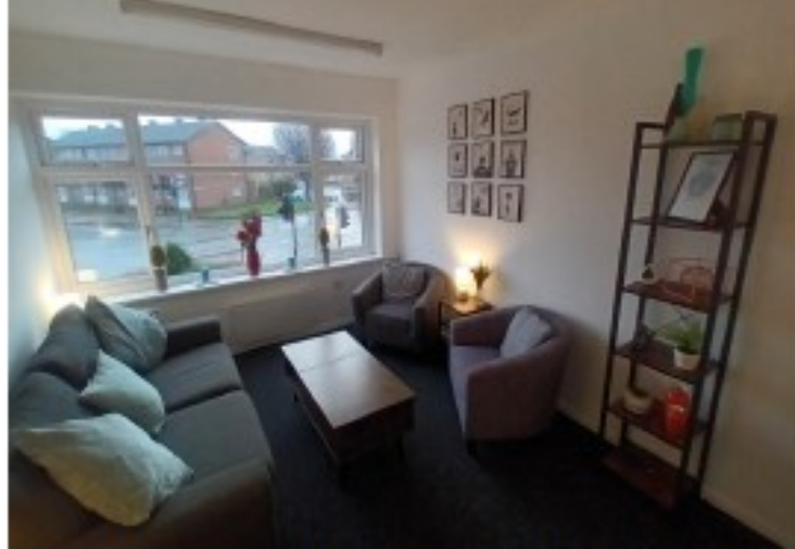
Our relaxing space at Seemore Business Centre, Ossett (Wakefield centre)